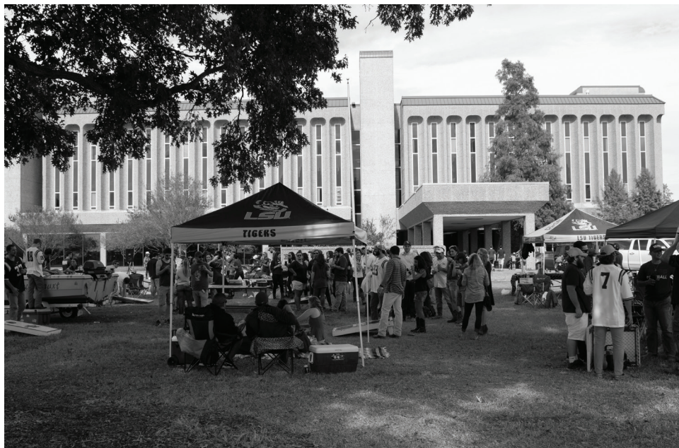
Fall in south Louisiana means LSU Tiger football and tailgating.

The Department of University Recreation provides a variety of recreational activities. To meet the diverse needs and interests of the University community, a multifaceted recreational program is offered that includes aquatics, informal recreation, healthy lifestyle programs, intramural sports, adventure recreation, sport clubs, and special event activities. For additional information, contact the Department of University Recreation.