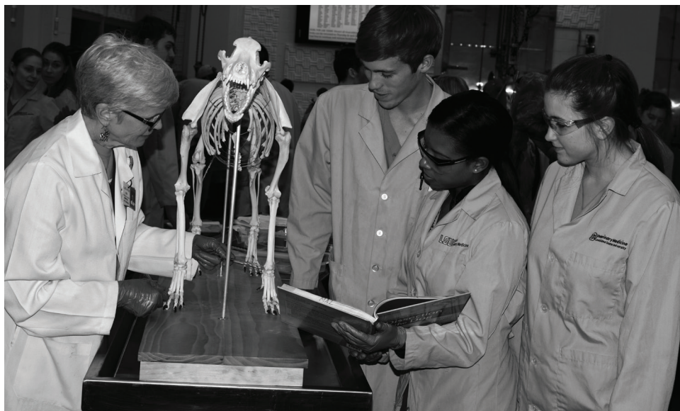
We Teach: First-year students spend up to 10 hours a week in anatomy lab.

2 (1) 35 contact hours. The Clinical Skills 2 Spring course is a mastery course that uses instructional videos, models, mannequins, simulators,