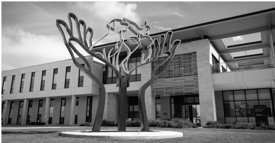
The LSU School of Veterinary Medicine has installed a stunning new sculpture titled, “In Our Hands” by DiBari & Associates. The sculpture is prominently positioned in front of the Stephenson Pet Clinic on Skip Bertman Drive, between the Mississippi River and Tiger Stadium, in Baton Rouge. Funded by the Percent for Art Program under Louisiana’s Division of the Arts, Office of Cultural Development, this artwork symbolizes the school’s commitment to the wellbeing of animals and people alike.