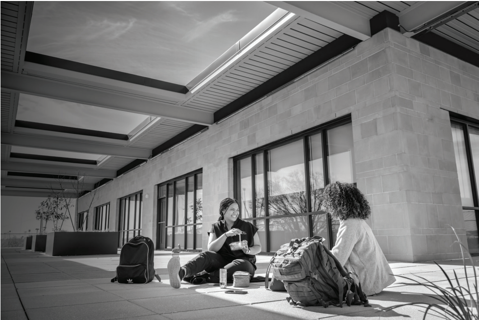
The Stephenson Pet Clinic Terrace is a great place to hang out, study, visit with friends, and enjoy a great view.

May 3 Concentrated Study Period ends May 4-9 Final Examinations May 13 Final grades due at 9 a.m. May 15-16 Commencement will be held over a two-day period