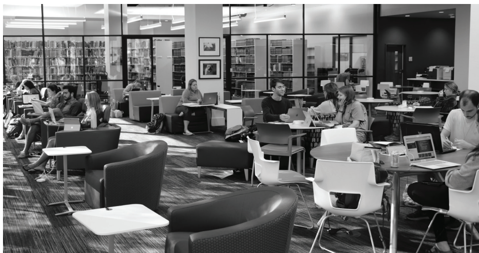
We Teach: The LSU Veterinary Medicine Library is accessible 24/7.

All fees are estimates and the LSU Board of Supervisors may modify tuition and/or fees at any time without advance notice. Check current tuition and fees at www.lsu.edu/bgtplan/Tuition-Fees/fee-schedules.php .