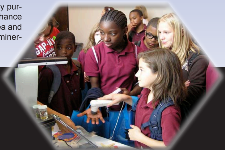
Right: At Ocean Commotion, students observed magnified views when using Scope-On-A-Rope.

als. Students were able to take home an expanded appreciation of the importance of the aquatic environment and the need to conserve its resources.